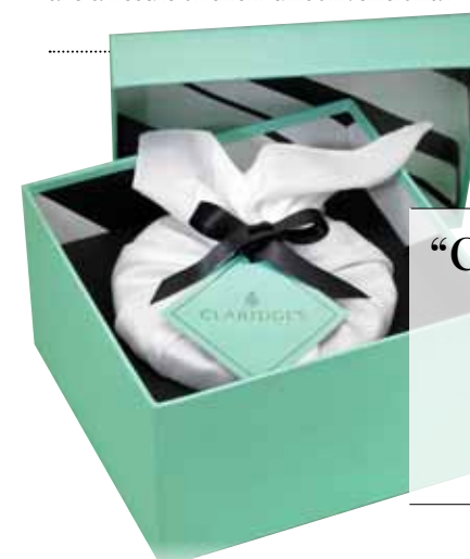
CLARIDGE'S CHRISTMAS PUDDING, £40.55, AVAILABLE FROM CLARIDGE'S (020 7409 6232; CLARIDGES.CO.UK)

The Winter's Tale runs until 18 January (branaghtheatre.com)