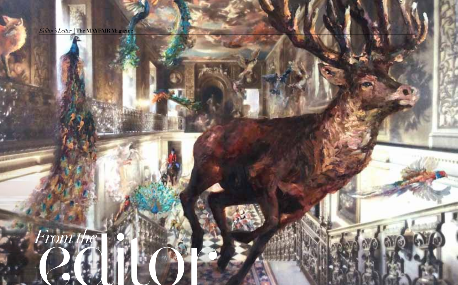
ABOVE: UNTITLED, NICOLE ETIENNE, 2015. 47 INCHES HIGH BY 71 INCHES WIDE, OIL PAINT, COPPER LEAF, ON PHOTO OF CHATSWORTH HOUSE INTERIOR ON GLITTER CANVAS (SEE PAGE 20)