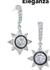
#3 Cosmos drop earrings, £5,500, Boodles (boodles.com)