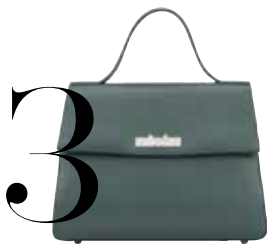
#3 Bruton large day bag, £1,440, William & Son (williamandson.com)