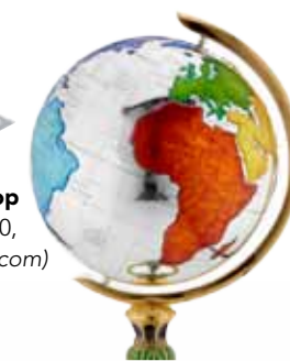
#4 Enamelled Silver Plated Globe £11,999, Carrs (harrods.com)