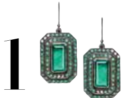
#1 Emerald Step earrings, POA, Solange Azaury-Partridge (solange.co.uk)