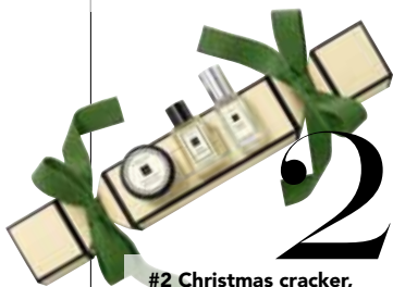
#2 Christmas cracker, £32, Jo Malone London (jomalone.co.uk)