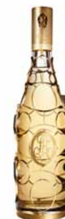
#5 Louis Roederer Cristal Gold Caged Jeroboam, Limited Edition, 2002 £18,000, (harrods.com)