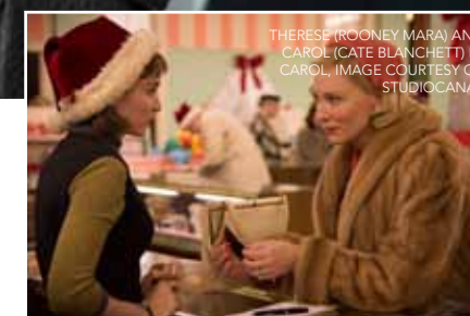
THERESE (ROONEY MARA) AND CAROL (CATE BLANCHETT) IN CAROL

The characters' emotional obstacles are a result of their unconventional