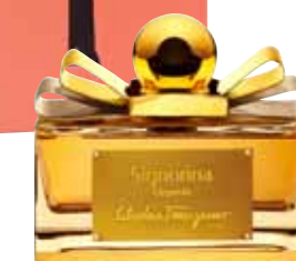
#2 Salvatore Ferragamo Signorina Eleganza Unique Edition, £26,500, (harrods.com)