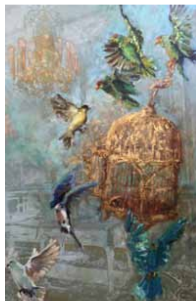
THE GREAT ESCAPE BY NICOLE ETIENNE, 2015, OIL PAINT, 23 CARAT GOLD LEAF AND MIXED MEDIA ON GLITTER CANVAS, 149.9 X 100.3CM