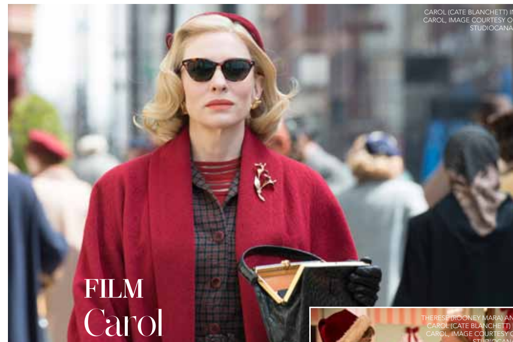
CAROL (CATE BLANCHETT) IN CAROL

The creative contributors behind the publication are a perfect reflection of the Berluti brand which prides itself on maintaining timeless style while having the courage to push sartorial boundaries - a truly collectable addition to your bookshelf. Berluti: At Their Feet published by Rizzoli, £64 or £280 for the limited edition (berluti.com)